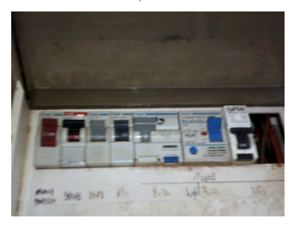
Fig. 9 Housing infrastructure.

The strength of Aboriginal and Torres Strait Islander culture in supporting food security has been demonstrated previously.[15,16] In the remote Northern Territory of Australia, it has been shown that 89% of households accessed traditional foods at least fortnightly, with 40% of food insecure households accessing traditional foods.[17] The sharing of food or resources among family members has been well documented in remote Australia.[15,17,34]