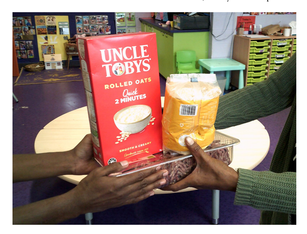
Fig. 3 Sharing as a part of culture.

Solutions. Many participants spoke of the need for decreasing healthy food and essential item prices in communities; 'If they lower the prices down here at the