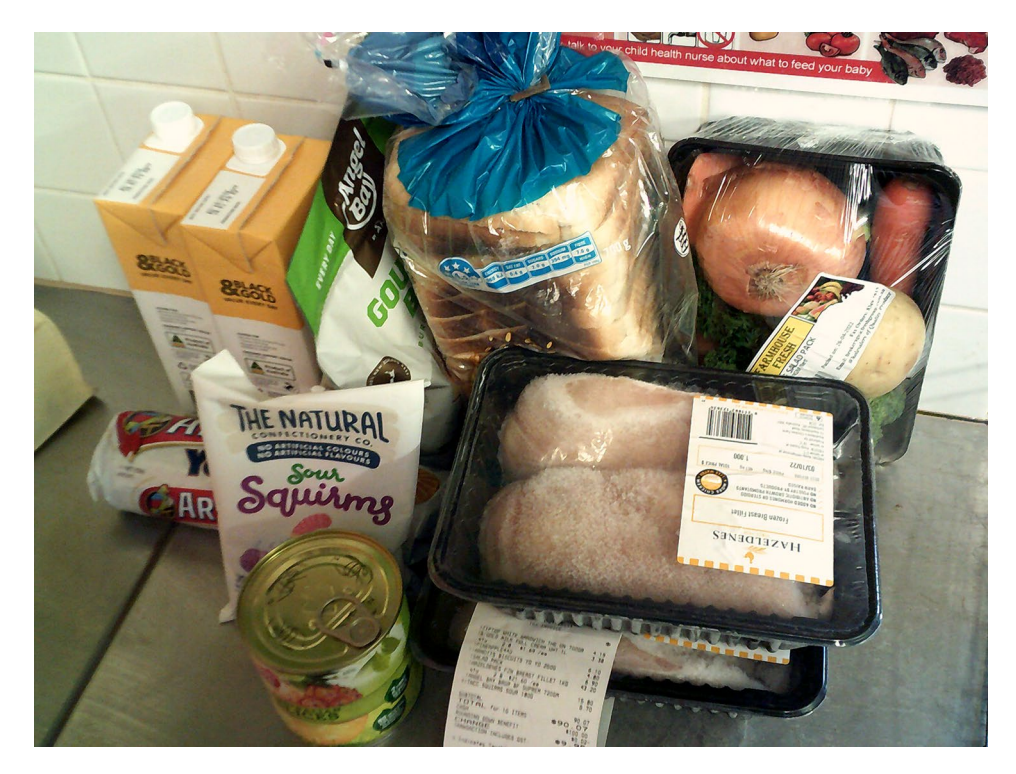
Fig. 4 '9 items for $90'- The cost of food. © Nikkita Sampson, Yuendumu. Used with permission.

Chappell et al. BMC Public Health (2024) 24:785 Page 8 of 17