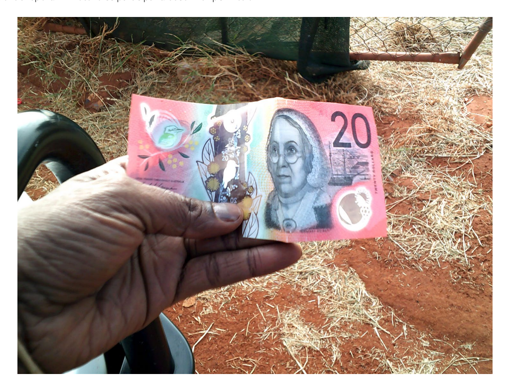
Fig. 7 Income.

When asked about running out of money before the next pay, one participant said 'Only the people who work find it easy.'(D7) Participants spoke about jobs as making it easier to save money for expenses, to buy food, and share food with others, and having less need to ask others for help (Fig. 8).