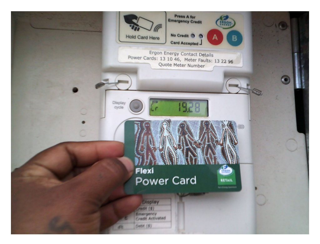
Fig. 5 The cost and availability of energy.

one participant described extending an electricity cord between two houses.