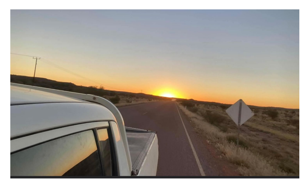
Fig. 6 The cost of transport.

Chappell et al. BMC Public Health (2024) 24:785 Page 10 of 17